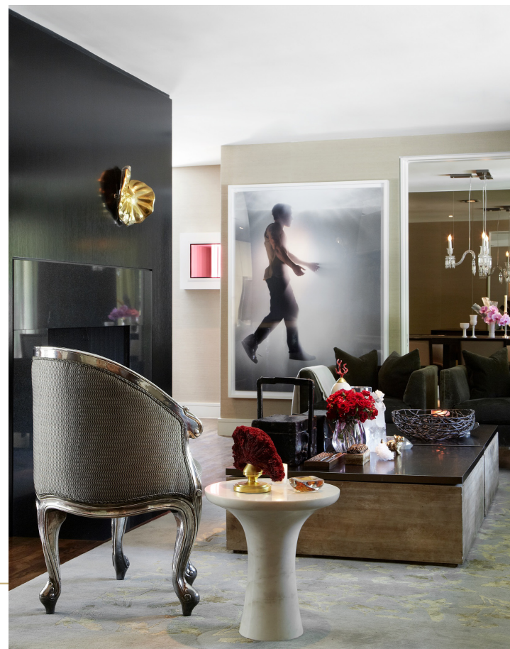
Dentwood, Stoneleigh, & Fairfax