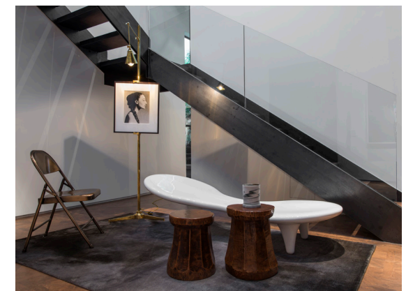
Springbrook Photos - Lisa Petrole