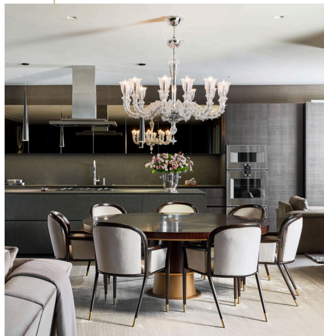
Dentwood, Stoneleigh, & Fairfax