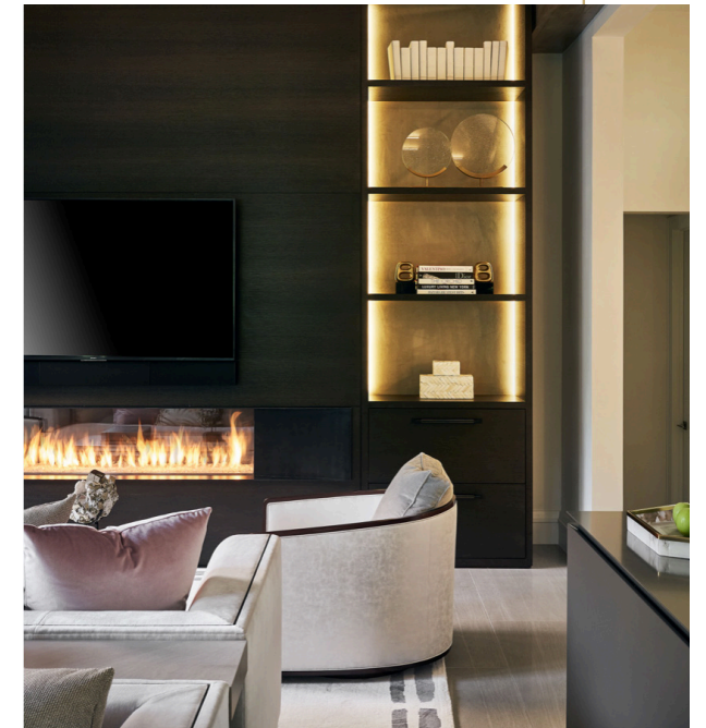
Dentwood, Stoneleigh, & Fairfax