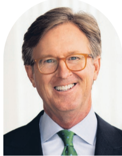
From the President's P.O.V.

The restaurant is called ASTRA Kitchen + Lounge, and it is newly opened inside the HALL Arts Hotel — which is adjacent to HALL Arts Residences. Some of the other perks in that sleek tower include a glass-walled wine room, a spa-treatment room and a rooftop putting green with the most thrilling skyline views imaginable.